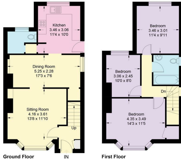
Illustration for identification purposes only, measurements are approximate, not to scale. Fourtabs.co © (ID1240870)

Approximate Gross Internal Area = 91.0 sq m / 987 sq ft